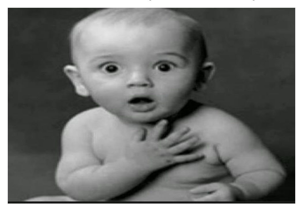
If so, then don't panic!! your Cheshire schools team is here to help...